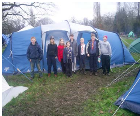
Winter Camp 2007

In hot weather the full uniforms can be very warm. Therefore we have our own T-shirts which can be worn in place of the official sweatshirts/shirts. To order one of these please complete the Group T-shirt Form.